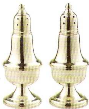
Empire Sterling. Sterling silver. 4½" h. x 1¾" diam. $118/pair. At William Ashley.