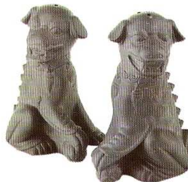
Wedgwood Dynasty. Bone china. 3½" h. x 2¼" w. $40/pair. At William Ashley.