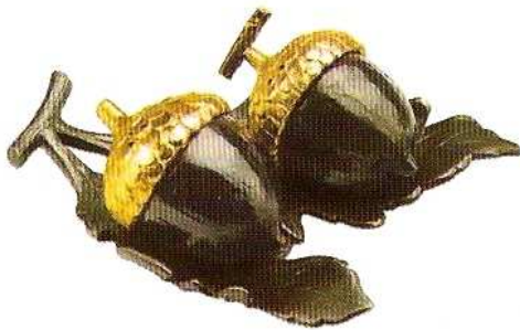
Michael Aram Acorn. Bronze; goldplate; copperplate. 2" h. x 5½" w. x 4" d. $99/pair. Through AT Design.