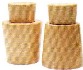
Avva by Thea Mehl for Teroforma. Beech. 4½" h. x 3" diam. $99/pair. Through Homewerx.