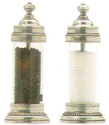
1182.0 and 1183.0. Pewter; crystal. 6" h. x 2½" diam. $268/pair. Through Match.