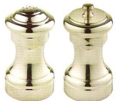
Empire Sterling. Sterling silver. 4" h. x 2" diam. $320/pair. At William Ashley.