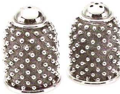
Studded collection. Pewter. 6" h. x 4½" diam. $75/pair. At Birks.