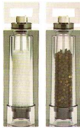
Zak Meeme in Smoke. Acrylic; ceramic. 6¼" h. x 1¾" sq. $38/pair. At retailers across Canada.