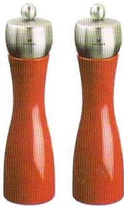
Peugeot Fidji. Lacquered beech; stainless steel. 6" h. $110/pair. Through Swissmar.