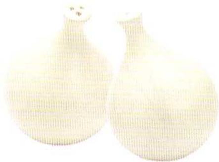
Eva Zeisel Granit. Stoneware. 4" h. x 3" diam. $38/pair. At Design Within Reach.