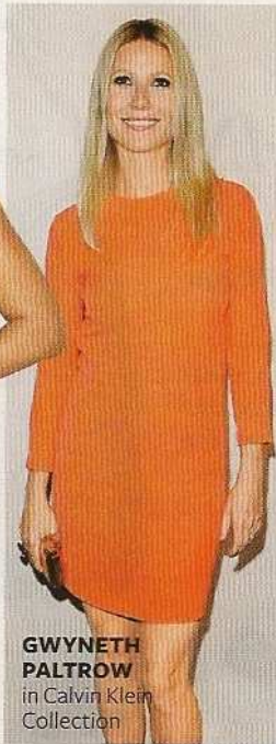
GWYNETH PALTROW in Calvin Klein Collection