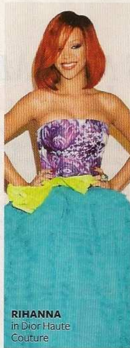
RIHANNA in Dior Haute Couture

FASHION Highlighter hues have gone high fashion. Leona Lewis and Gwyneth Paltrow tamed hot pink, yellow, and orange with neutral shoes or simple silhouettes, while Rihanna embraced the look in her own grand manner.