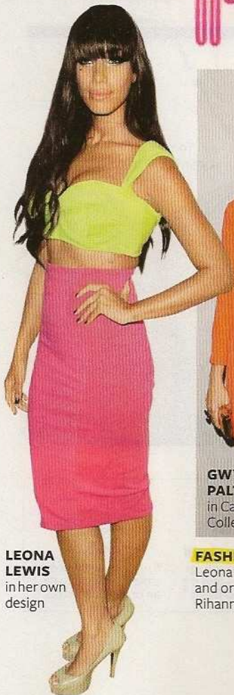
LEONA LEWIS in her own design